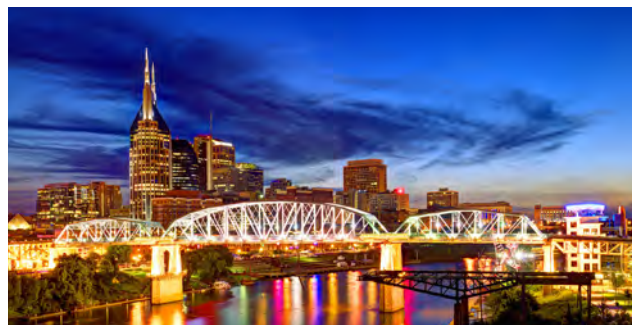
ENAR 2020 SPRING MEETING March 22-25, 2020 | Nashville, TN JW Marriott Nashville