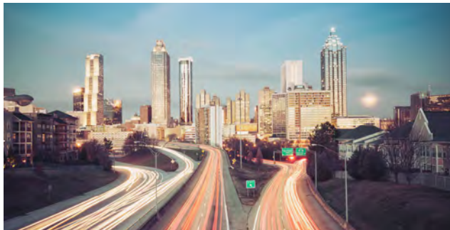
ENAR 2018 SPRING MEETING March 25-28, 2018 | Atlanta, GA Hyatt Regency Atlanta on Peachtree Street